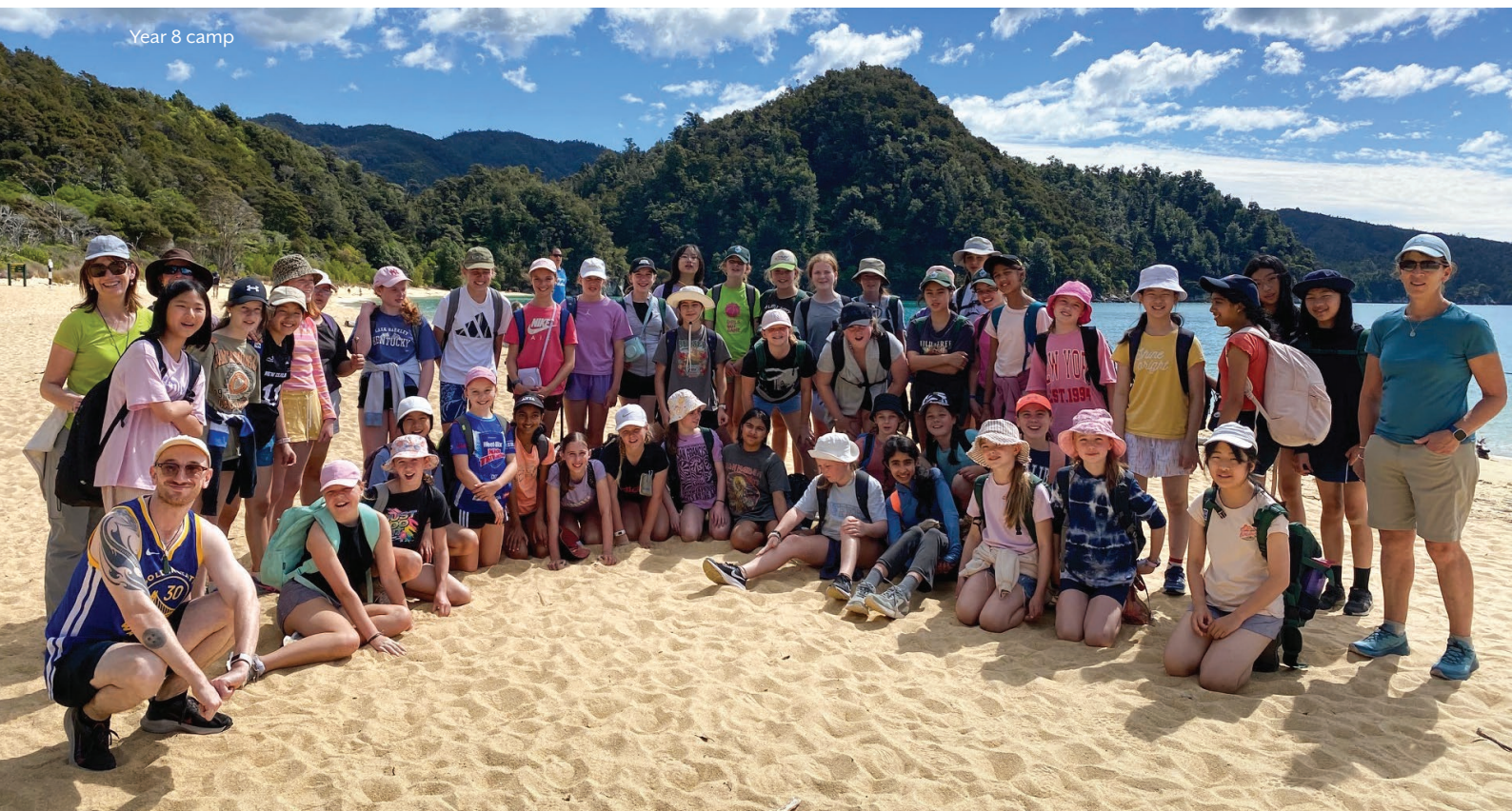
Year 8 camp

the allocation of teacher aide support to students who may need additional in-class assistance. Where parents have specific concerns about their daughter's additional learning needs, we recommend a discussion with our Head of Personalised Learning to explore options. For those seeking one-on-one tuition, we partner with an external provider for add-on in-school learning support.